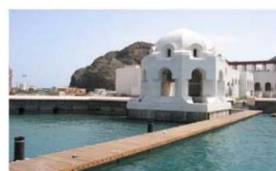
Qsr Al Alam Marina FilInternbetcn Muscat, Oman