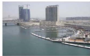
Marasi Marina Business Bay Dubai Properties Dubai, UAE