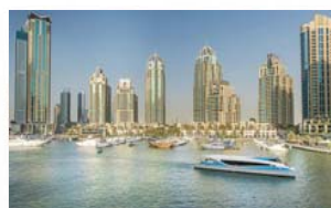
West Marina Stage-2 EMAAR Properties Dubai, UAE