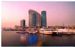
Dubai Festival Marina Dubai Festival City Dubai, UAE