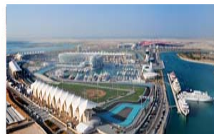
Yas Marina Aldar Properties Abu Dhabi, UAE