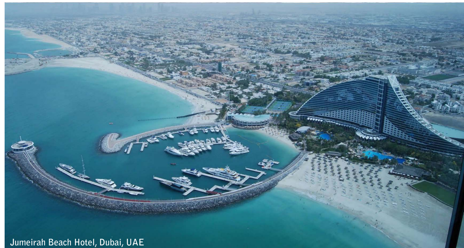
Jumeirah Beach Hotel, Dubai, UAE