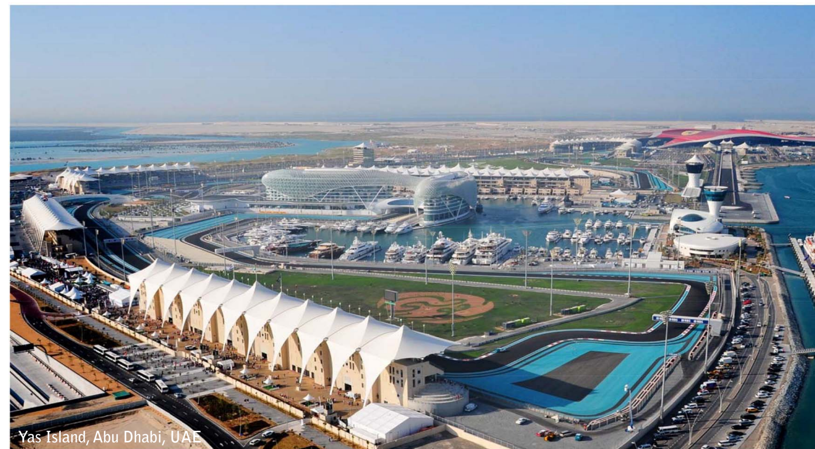
Yas Island, Abu Dhabi, UAE