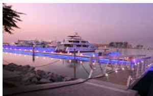
DIMC-Super Yatch Marina DIMC Mina Seyahi Dubai, UAE