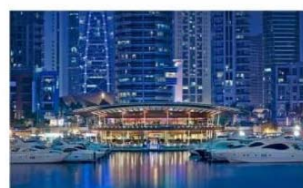
Dubai Yatch Club Marina EMAAR Properties Dubai, UAE