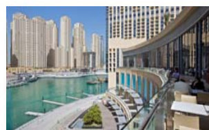
Marina Mall EMAAR Dubai, UAE