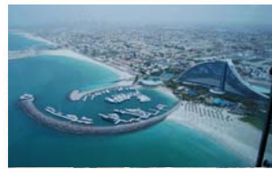
Jumeirah Beach Hotel Marina Dubai Investment Group Dubai, UAE