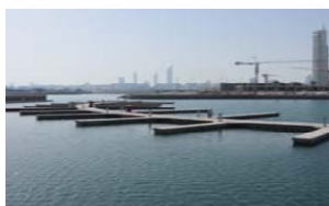
Najmat Marina Reem Developers Abu Dhabi, UAE