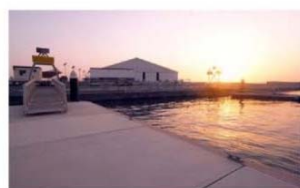
Sky Dive Replacement Pontoons Sky Dive Dubai Dubai, UAE