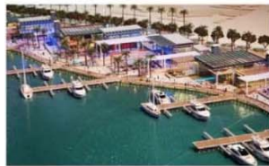
Marsa Al Seef Meraas Dubai, UAE