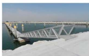
Daren Port Expansion STFA/Aramco Qatif, Saudia Arabia