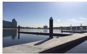
Cultural Village Dubai Properties Dubai, UAE