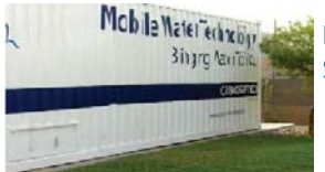
Iberdrola Power Station Iberdrola Doha, Qatar