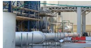
DSWMC Keppel Seghers Doha, Qatar