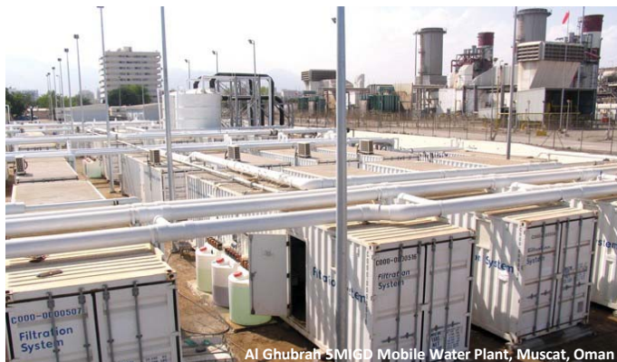
Al Ghubrah SMC Mobile Water Plant, Muscat, Oman