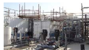
Tatweer Petroleum Tatweer Bahrain