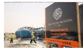
Tigerwood Tatweer Dubai, UAE