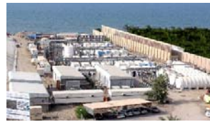
Al Ghubrah Desalination Public Water And Electricity Oman