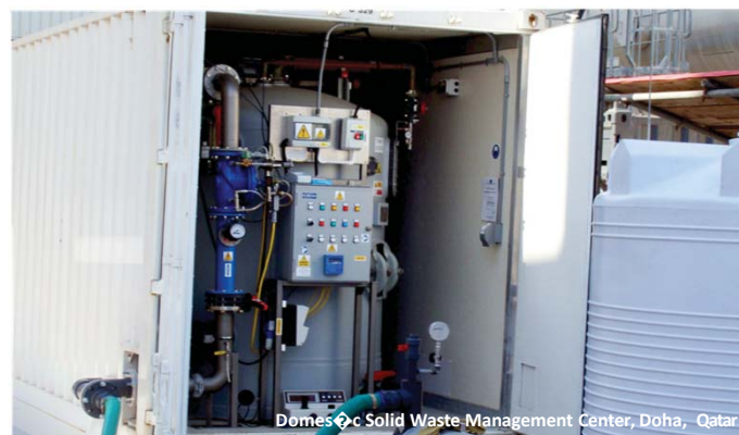
Domes Solid Waste Management Center, Doha, Qatar