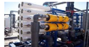
Saadiyat Island TDIC Abu Dhabi, UAE