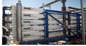
Saadiyat Island TDIC Abu Dhabi, UAE