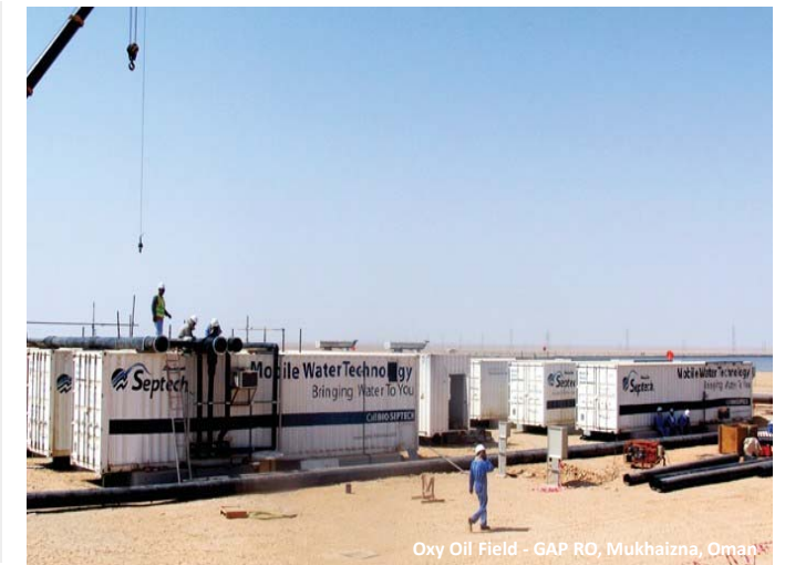
Oxy Oil Field - GAP RO, Mukhaizna, Oman