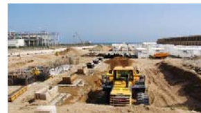
Oxy Oil Field Mukhaizna Oman