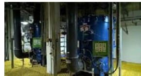
Pearl Diving Pool Brookfield Multiplex Dubai, UAE