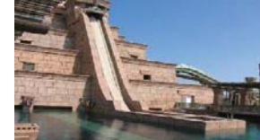
Atlantis Kerzner Dubai, UAE