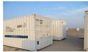
ASR Schlumberger Schlumberger Qatar