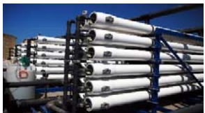
Saadiyat Island TDIC Abu Dhabi, UAE